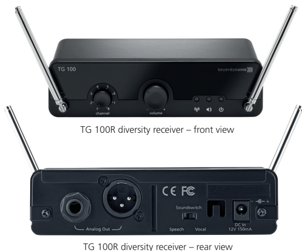
TG 100R diversity receiver – front view

Set with VHF Diversity Receiver and Beltpack Transmitter