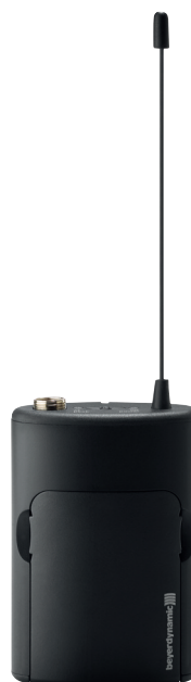
TG 100B beltpack transmitter